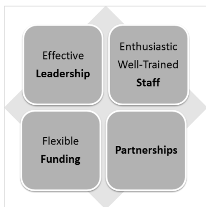
FOUR KEY ELEMENTS

The Secure Jobs Initiative is a public/private partnership, led by The Fireman Foundation, designed to link homeless families participating in Massachusetts' HomeBASE program to the resources and services they need to enter and sustain employment. During Phase 1 of Secure Jobs, workforce development and homeless services are linked at 5 sites across Massachusetts to offer a comprehensive and individualized set of services that addresses these families' barriers to employment and gives them both the tools they need to enter the workforce and the critical connections to employers that will help them get